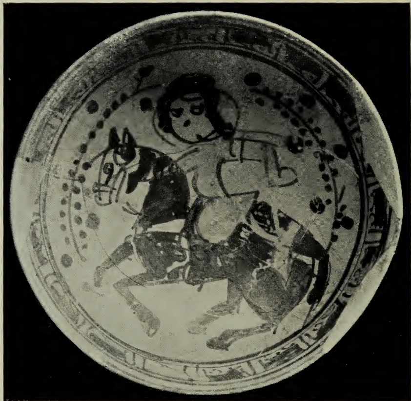
PERSIAN DISH, ELEVENTH CENTURY (?)